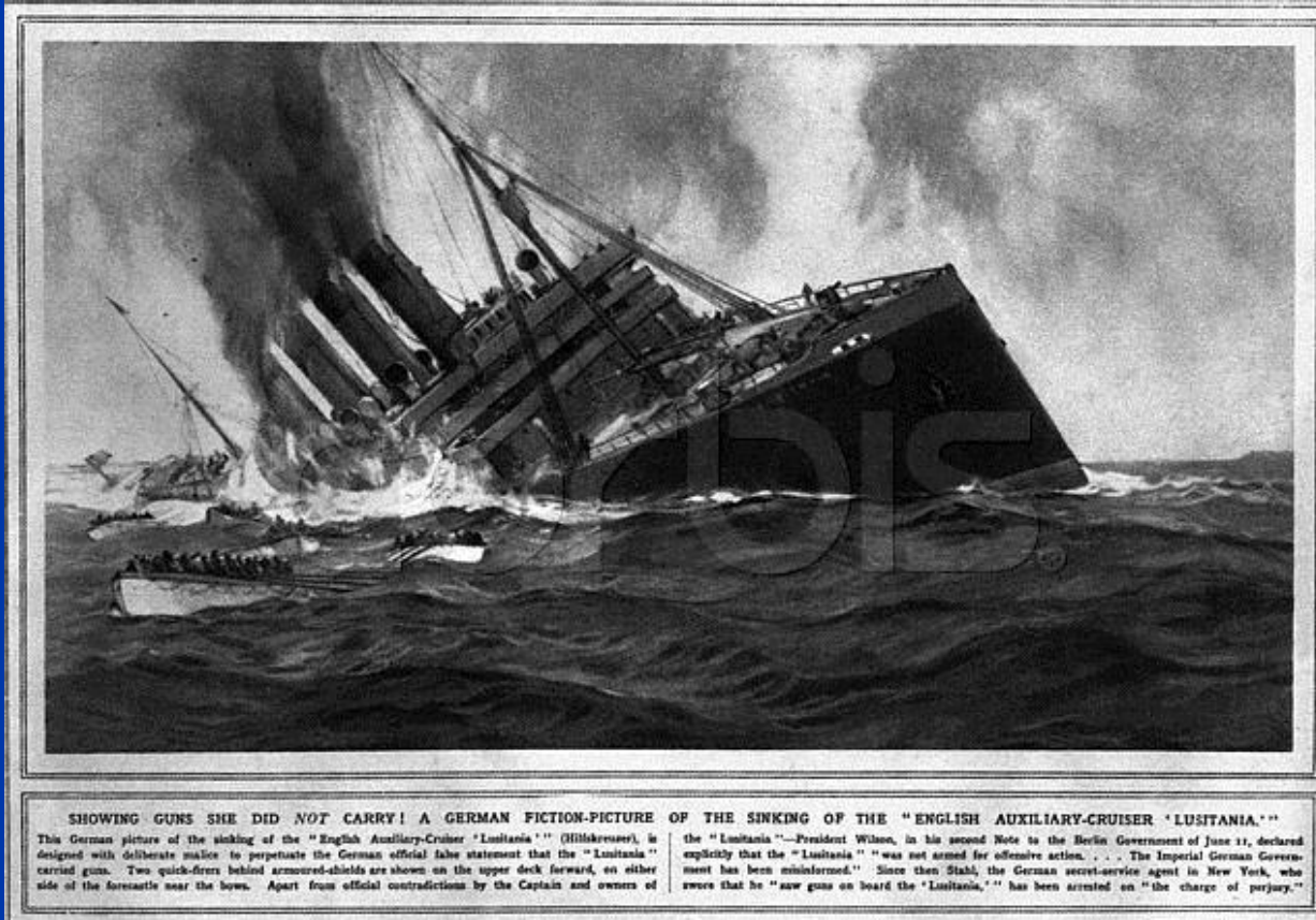
German Propaganda Justifying Lusitania sinking

5. When the US criticized Germany for their action, Germany said it would stop.