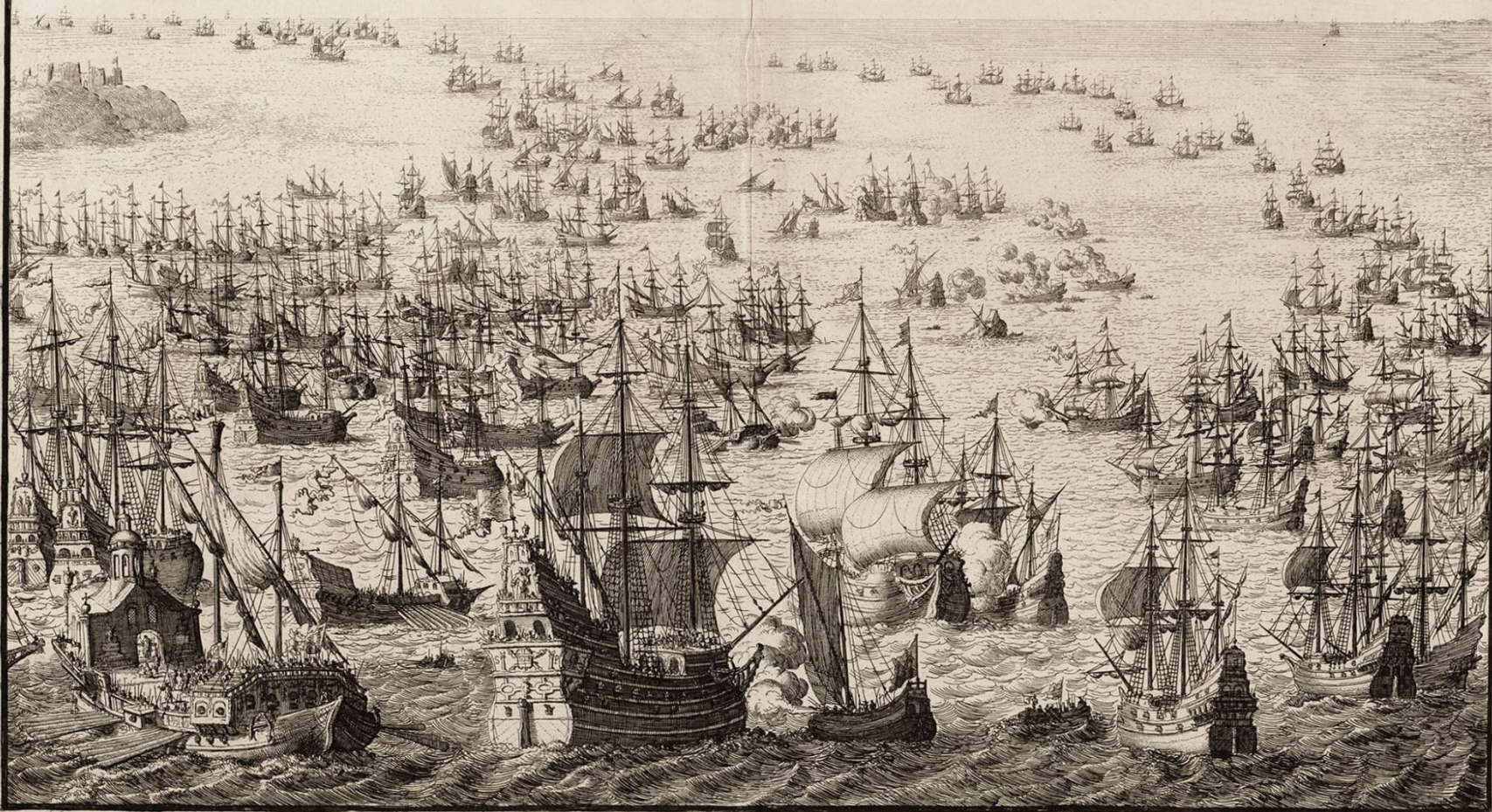
Vertooninge van de ontsachlyke Spaansche Krygs vloot, in den Jaare 1588.