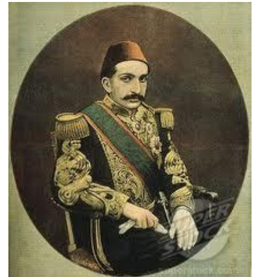
Abdul-Hamid KHAN II