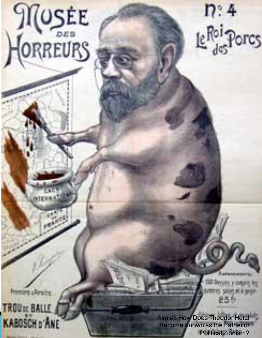
Aim #5 How Does Theodor Herzl Become known as the Father of Political Zionism?