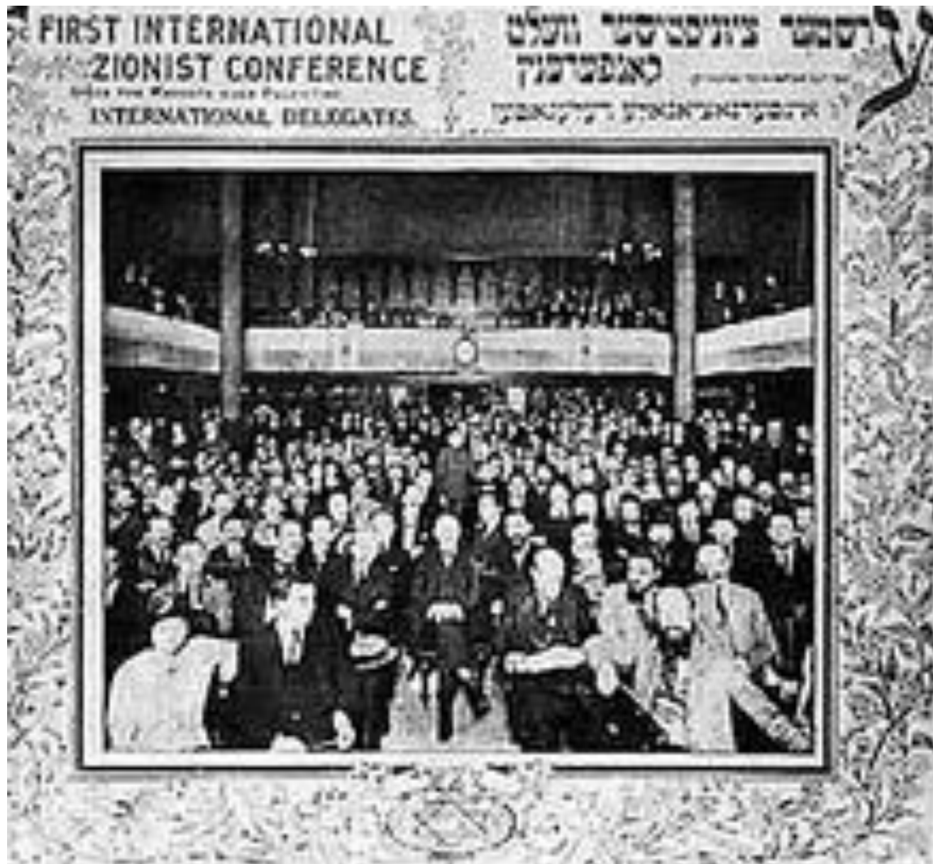
Aim #5 How Does Theodor Herzl Become Known as the Father of Political Zionism?