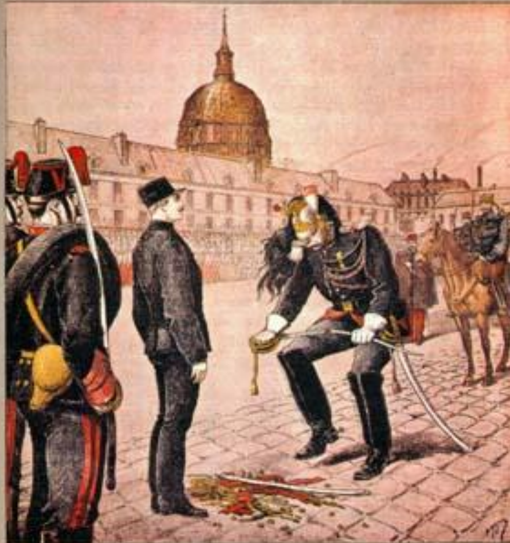
LE TRAITRE Dégradation d'Alfred Dreyfus

Aim #5 How Does Theodor Herzl Become Known as the Father of Political Zionism?