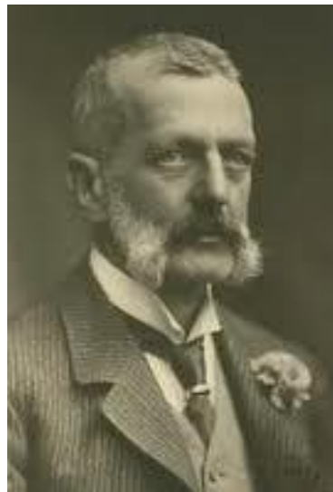
Grand Duke Vladimir Romanov