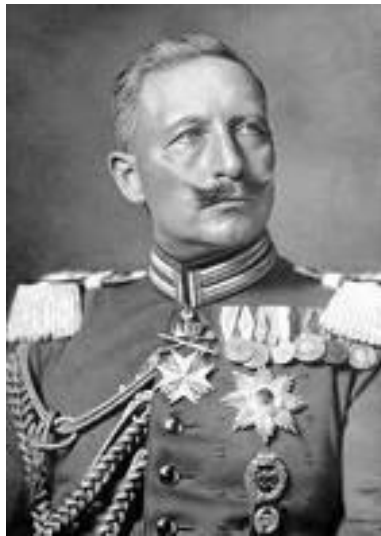
Keizer Wilhelm II