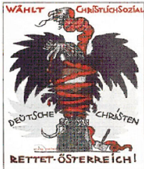
The Jew as a snake, strangling Germany and Christendom.