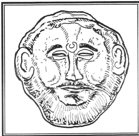
Death mask of a Mycenaean king

The Dorians dominated the Peloponnesus between 1100 and 800 B.C. This period is known as the Dark Age of Greece. The Dorians destroyed Mycenaean culture, but did not replace it with anything as grand. The Dark Age saw an end to palace-centered monarchs on the Peloponnesus.