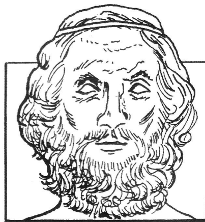
The Greek epic poet Homer was, according to legend, blind.

Similarly, the Odyssey is a story of epic heroism. The hero, Odysseus, has been imprisoned for seven years by a sea nymph. During a council of the Greek gods, Zeus allows Odysseus to gain his freedom and return home to his wife, Penelope. For most of the poem,